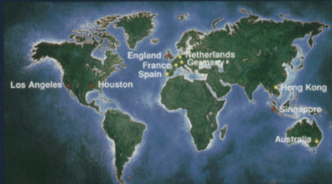
★ Haskel Manufacturing Divisions ● Haskel Subsidiaries & Regional Offices

Haskel International, Inc. has over 50 years of hydraulic and pneumatic engineering experience in the design and manufacturing of the widest range of air-driven liquid pumps, gas boosters, amplifiers, accessories and systems available in today's market.